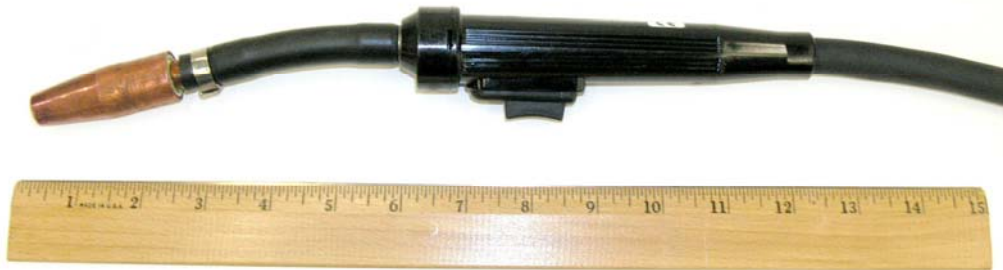
Figure 8: Tweco-Based Ultralight Torch (flexible neck)