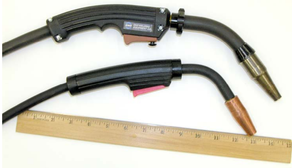
Figure 9: Size Comparison Between Lincoln-Based Ultralight Torch (Bottom) and Standard 200A OXO AP20 Torch (Top)