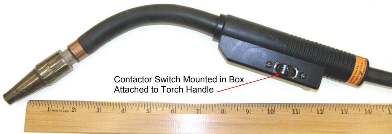
Figure 4: Original Prototype Ultralight GMAW Torch With 8 Inch Flex Neck

torch would have to be lighter in weight than currently available torches, comfortable in the welder's hand, and easily manipulated. None of the commercial torches examined had all of the desired attributes. Therefore, a prototype torch was developed by Electric Boat, ABCO, and Lenco. The prototype torch had an 8 in. long flex-neck head and was lighter in weight and more compact than the standard 200A OXO torch. Weld testing of this torch verified that its performance (arc and puddle characteristics, welding current and arc voltage for a given wire feed speed) was comparable to the OXO model. Figure 4 shows the prototype Ultralight GMA torch. Note that the contactor switch (on - off rocker) is mounted in a box attached to the torch handle. The switch itself and the mounting are non-typical. The most common switch is a momentary on - off lever switch mounted directly on the torch body.