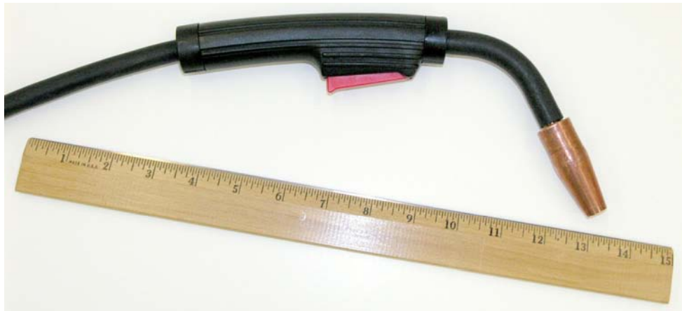
Figure 7: Lincoln-Based Ultralight Torch (fixed goose neck)

respect to measured amps and volts, and also in arc and puddle appearance. Therefore, the new prototype torches were judged to be compatible with the existing Electric Boat EB-200 MP welding procedures and thus suitable for shipyard welding. Multiple torch sets were procured and put into production. The new GMA torches, with their light weight, ease of manipulation, and comfort in the welder's hand, were well received and performed excellently. No negative comments were made by the users. These torches will become part of the production model EB-200 MP Ultralight welding systems that EB will procure. It is anticipated that by the time EB is ready to procure production systems, a redesigned SMA stinger incorporating an improved contactor switch on the torch handle will also be developed, tested, and approved by the EB Welding and Welding Engineering Departments.