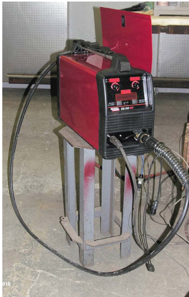
Figure 2: Prototype EB-200 MP “Ultralight” System With GMA Torch and Ground Lead Attached. Side Panel Door Open for Access to Wire Feed Motor and Wire Spool.

The system was evaluated by weld testing, and operational and user interface issues were noted. The case and packaging were also evaluated. The more significant items are listed below along with the Lincoln Electric comment or resolution .