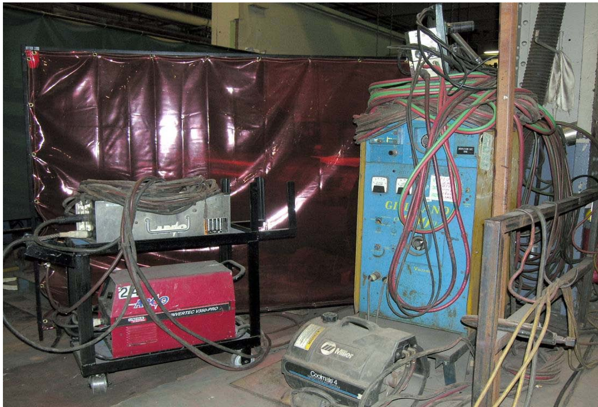
Lincoln V350 PRO