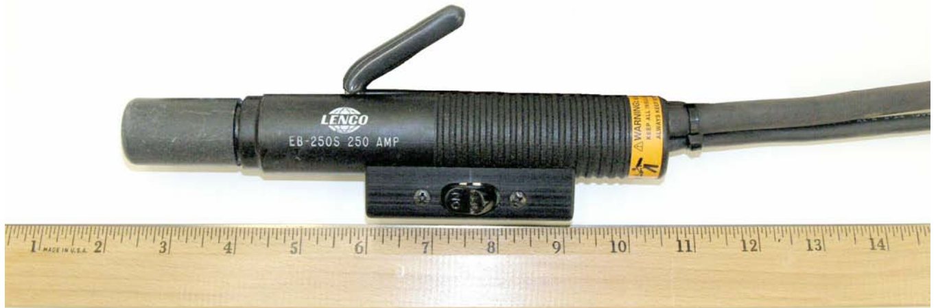
Figure 5: Prototype SMA Stinger

mode is switched from PGMAW to SMA on the front panel, the welder is ready for SMA welding. The entire process takes under a minute.