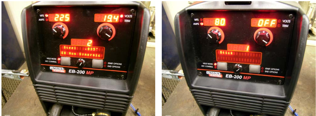
Figure 3: Front Panel Controls and Display on Prototype EB-200 MP “Ultralight” System With Typical Setting Displayed for PGMAW (Left) and Shielded Metal Arc (Right)

All electrode was ESAB 0.035 in. diameter, on 8 in. spools, either MIL-70S-3 or MIL-100S-1, as noted. Shielding gas was 5% CO 2 - 95% Ar. A 35 cfh flow rate into a #8 nozzle was used for mechanized bead on plate testing. Semi-automatic welding used a 30 cfh flow rate into a #6 nozzle. In both cases, the torch was a standard 200A OXO, Model AP20.