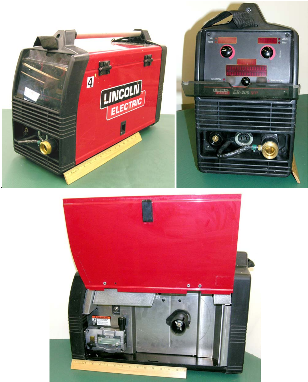
Figure 6: Alpha Ultralight Unit. Note fold down protective cover over controls and access to wire feeder under right side flip-up panel.